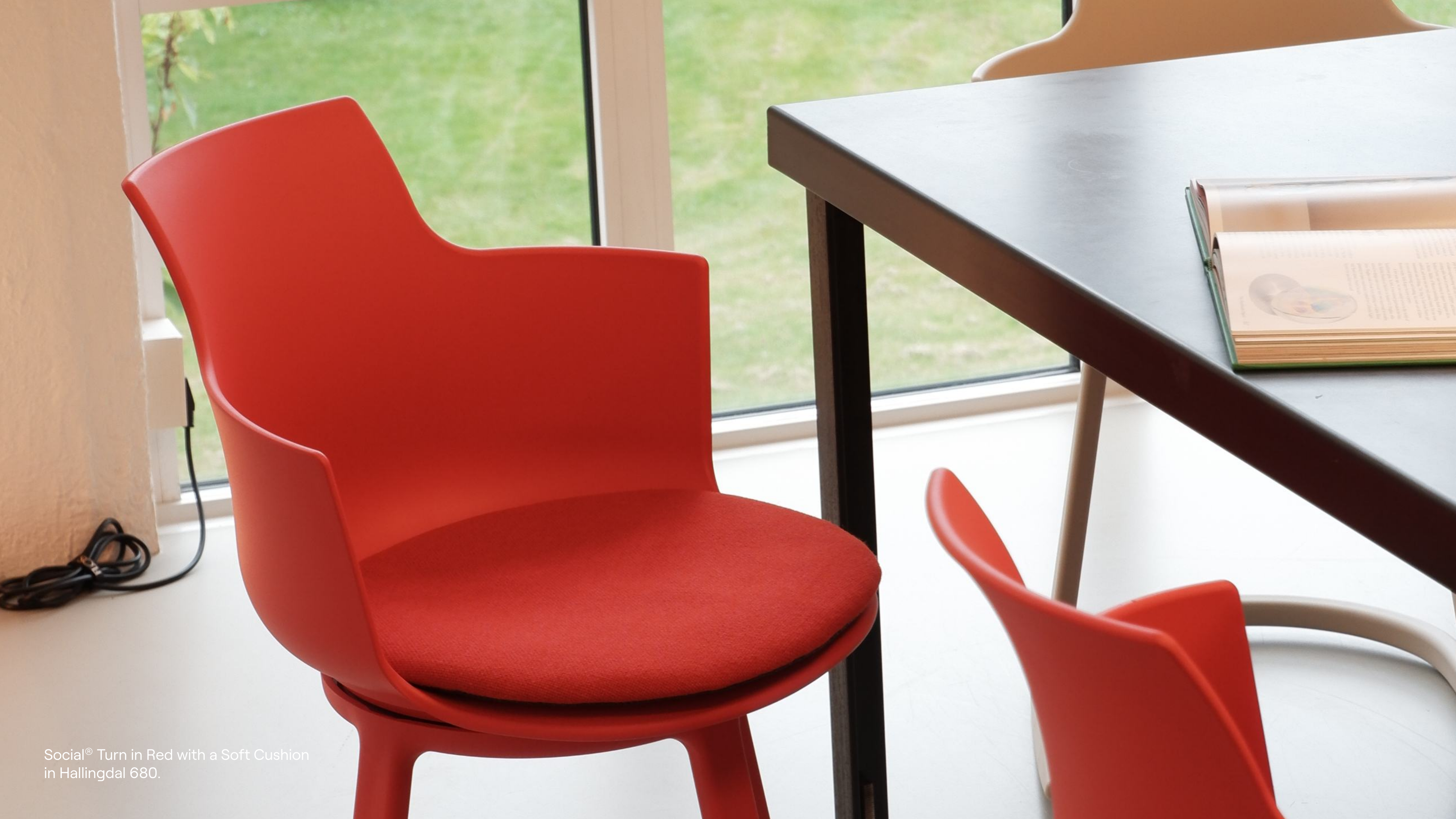
Social® Turn in Red with a Soft Cushion in Hallingdal 680.